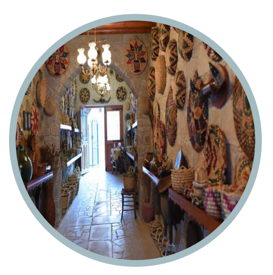
Basketry Museum in Choirokoitia Village