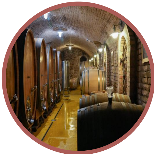
Fruška Gora Vine Cellar