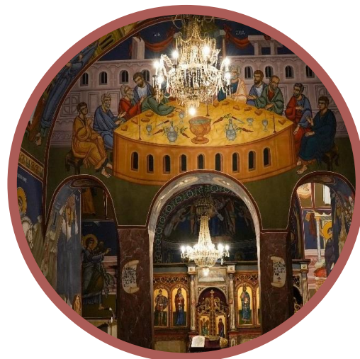
Fruška Gora Monastery Frescoes