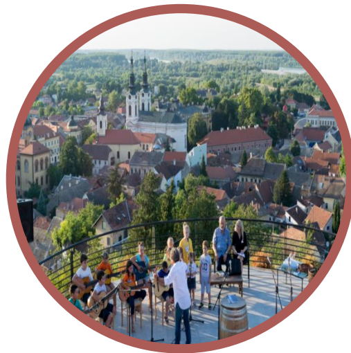
Sremski Karlovci ViewPoint