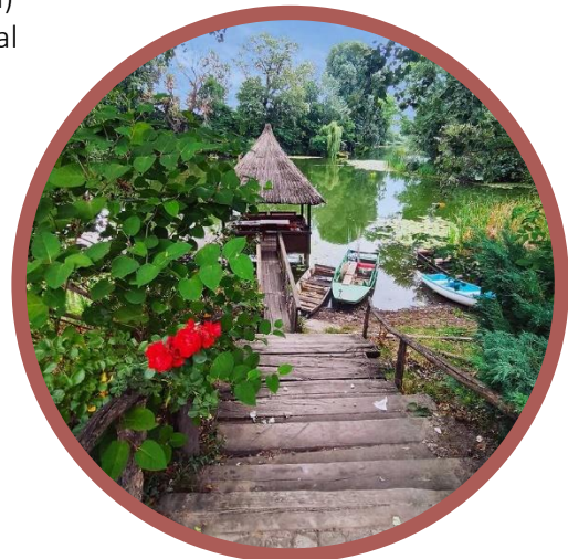
UNESCO Biosphere “Bačko Podunavlje”, Bač